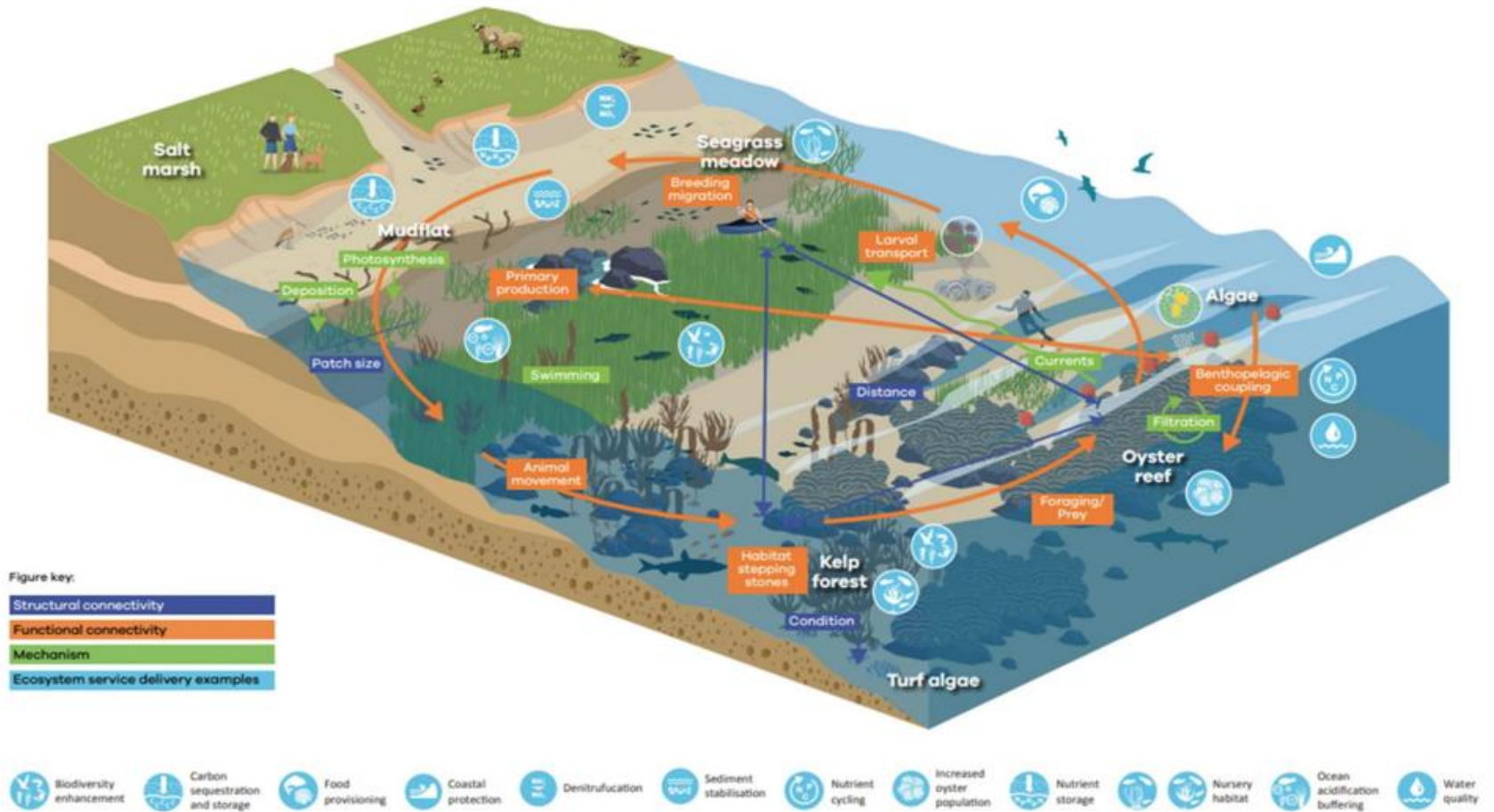
Graphic: Blue Marine Foundation / ZSL