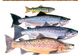
The Wye & Usk Foundation