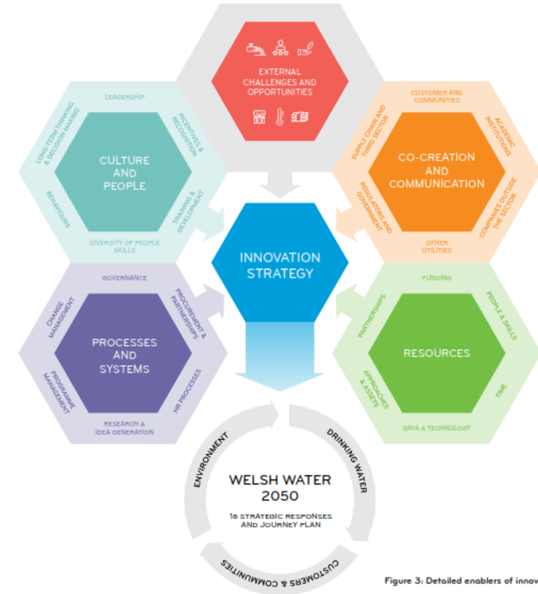
Figure 3: Detailed enablers of innovation